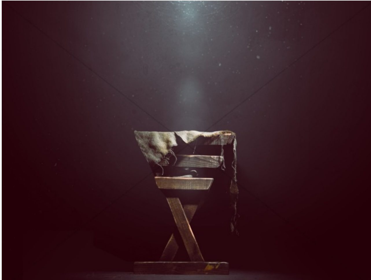
Instrumental introduction to “Silent Night: (Stille Nacht, Hymnal 1982 , 111)