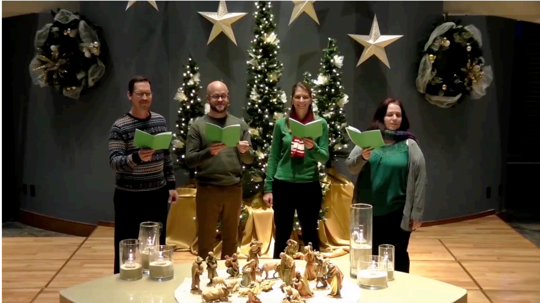
Joy to the World (Antioch, Hymnal 1982 , 100)