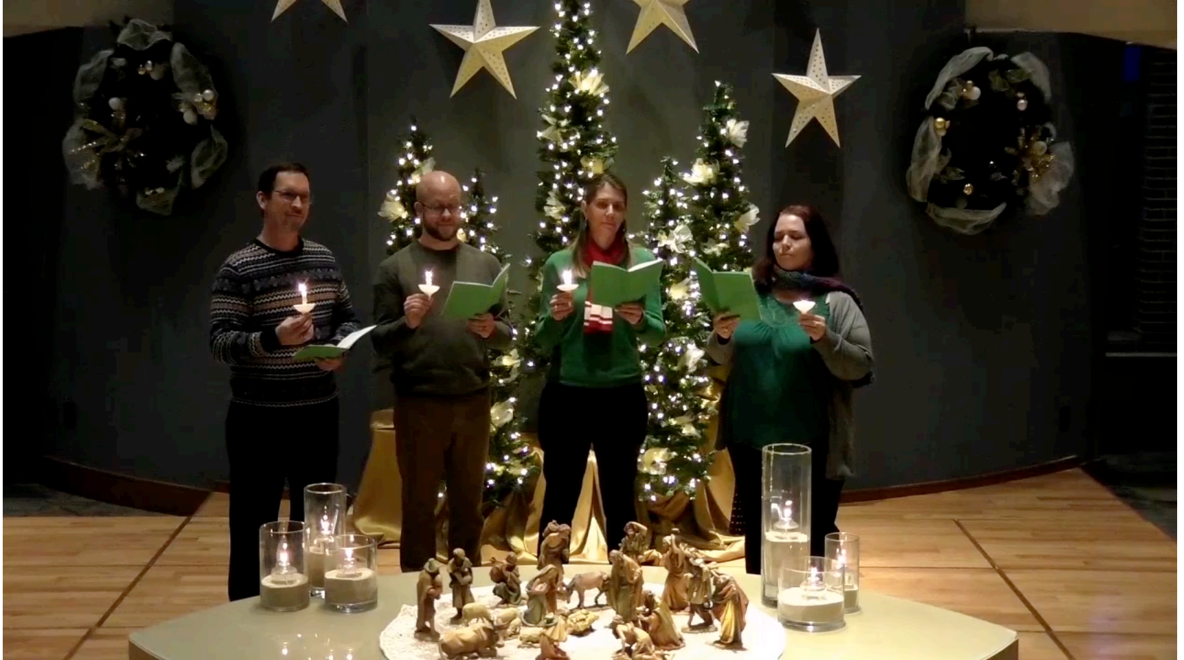
Silent Night (Stille Nacht, Hymnal 1982 , 111)