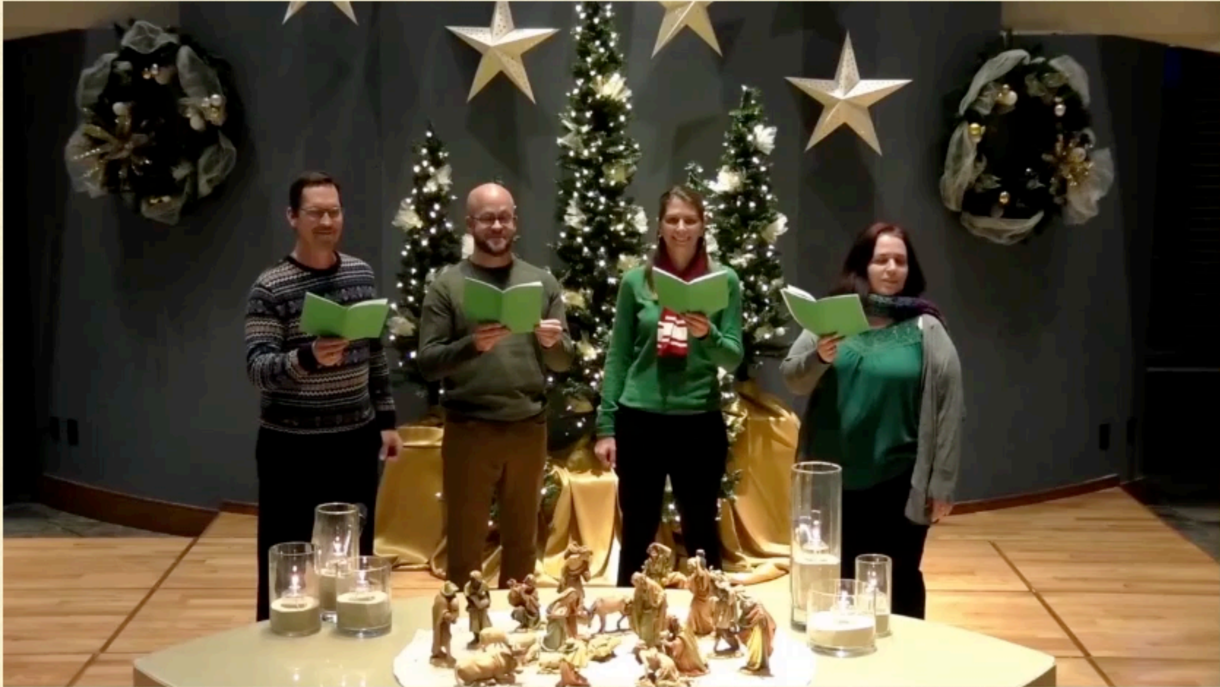
Joy to the World (Antioch, Hymnal 1982, 100)